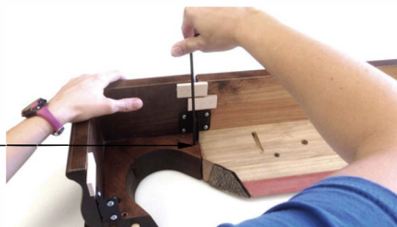
ACCESS HOLE FOR RAIL LOCK FASTENER