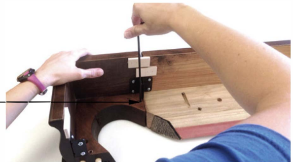
ACCESS HOLE FOR RAIL LOCK FASTENER